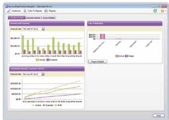
Quickly view your financial position