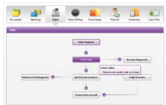
Quick assistance with HoverHelp