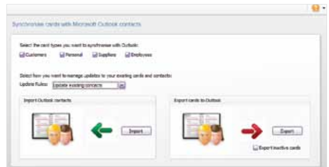
Effectively manage your clients