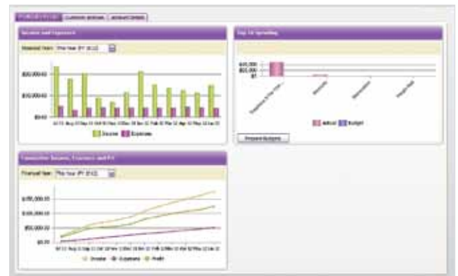
Quickly view your financial position