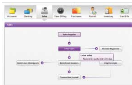
Quick assistance with HoverHelp