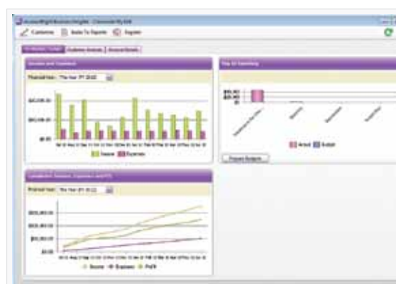
Quickly view your financial position